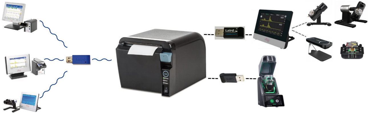
Item no. WT-SLK-TE25

Our new thermal printer is not only extremely innovative but also highly efficient. Compact and wireless. Thanks to its Bluetooth capability using a dongle, you will have more space on your desk.