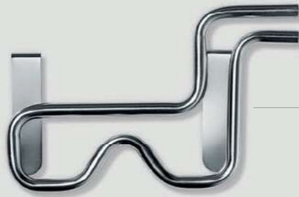
Cooling coil Material: Stainless steel

Technology from Elma is much more than just the cleaning devices themselves. With our accessories, you can extend the Easy series – simply and practically.