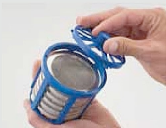
Filling baskets with watch parts

Elmasolvex® VA has its own self-contained intrinsic Ex-protection due to the vacuum technology used and all the measures required by TÜV and the applicable technical regulations for explosion safety. This means that the explosion protection measures integrated in the machine already rule out any fire hazard in the primary zone, operation in compliance with the manual provided. The use of ultrasound is thus legally possible and permitted. The TÜV test performed confirms the requirements for the use of the prescribed CE mark.