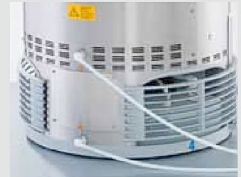
Controlled exhaust air routing