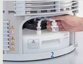
Connecting media containers