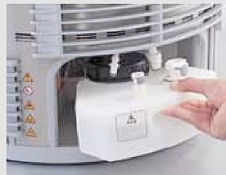
Installing media containers