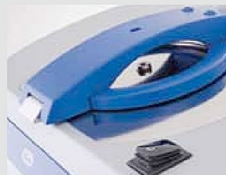
Vacuum is established