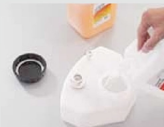
Filling cleaning and rinsing solution