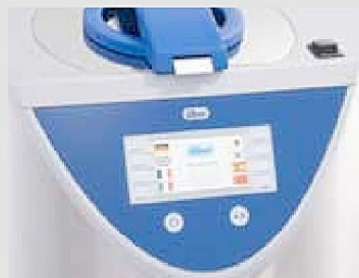
Selecting and starting program