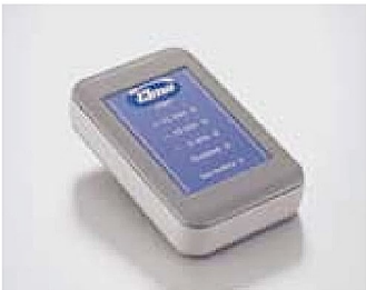
Elmasolvex® VA with wide range of accessories

The new standard for the use of flammable solvents in watch movement cleaning.