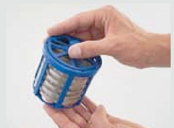
Removing cleaned and dried baskets